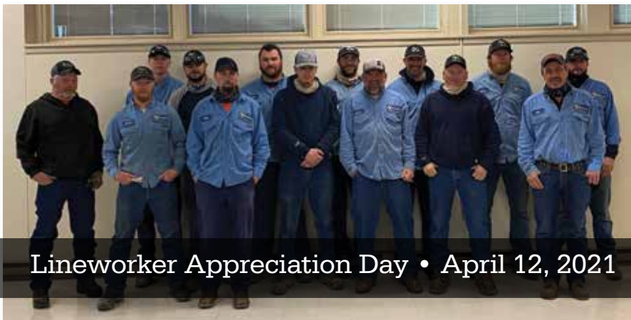
Lineworker Appreciation Day • April 12, 2021